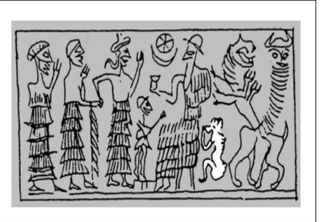
The new <u>CM domain</u> – Iconographic analysis of cylinder seals: Old Babylonian and Old Assyrian lexicons