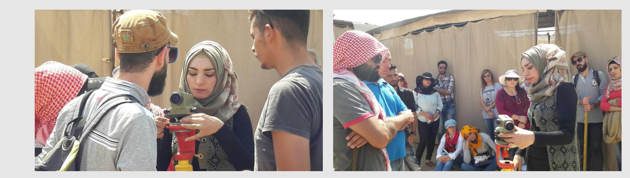
Learning how to use Niveau devise for measurements