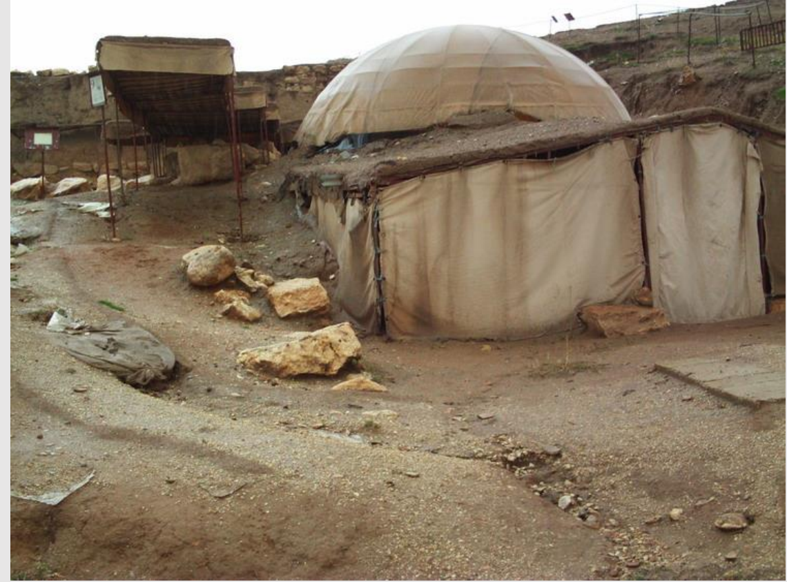
The Abi after a heavy rain storm