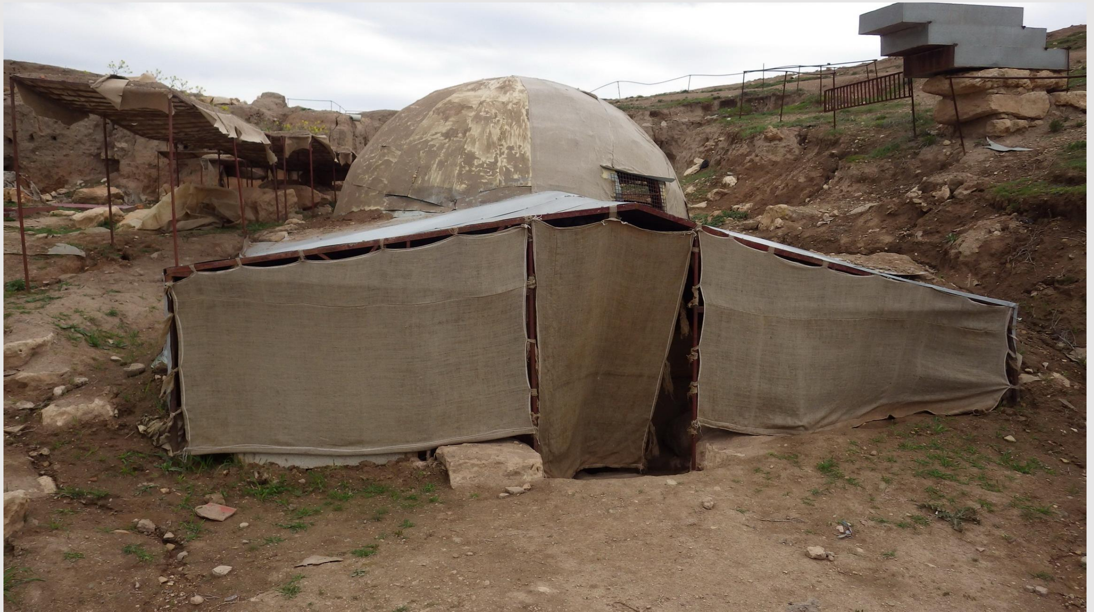
New Abi- March 2015