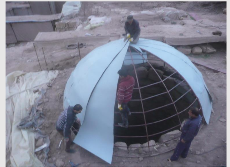
Securing the metal sheets

Covering the base of the dome with bitumen