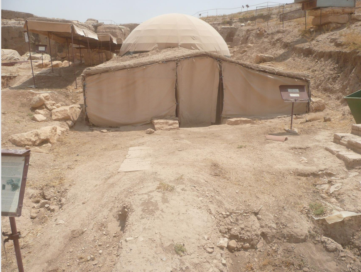
Condition of the Abi