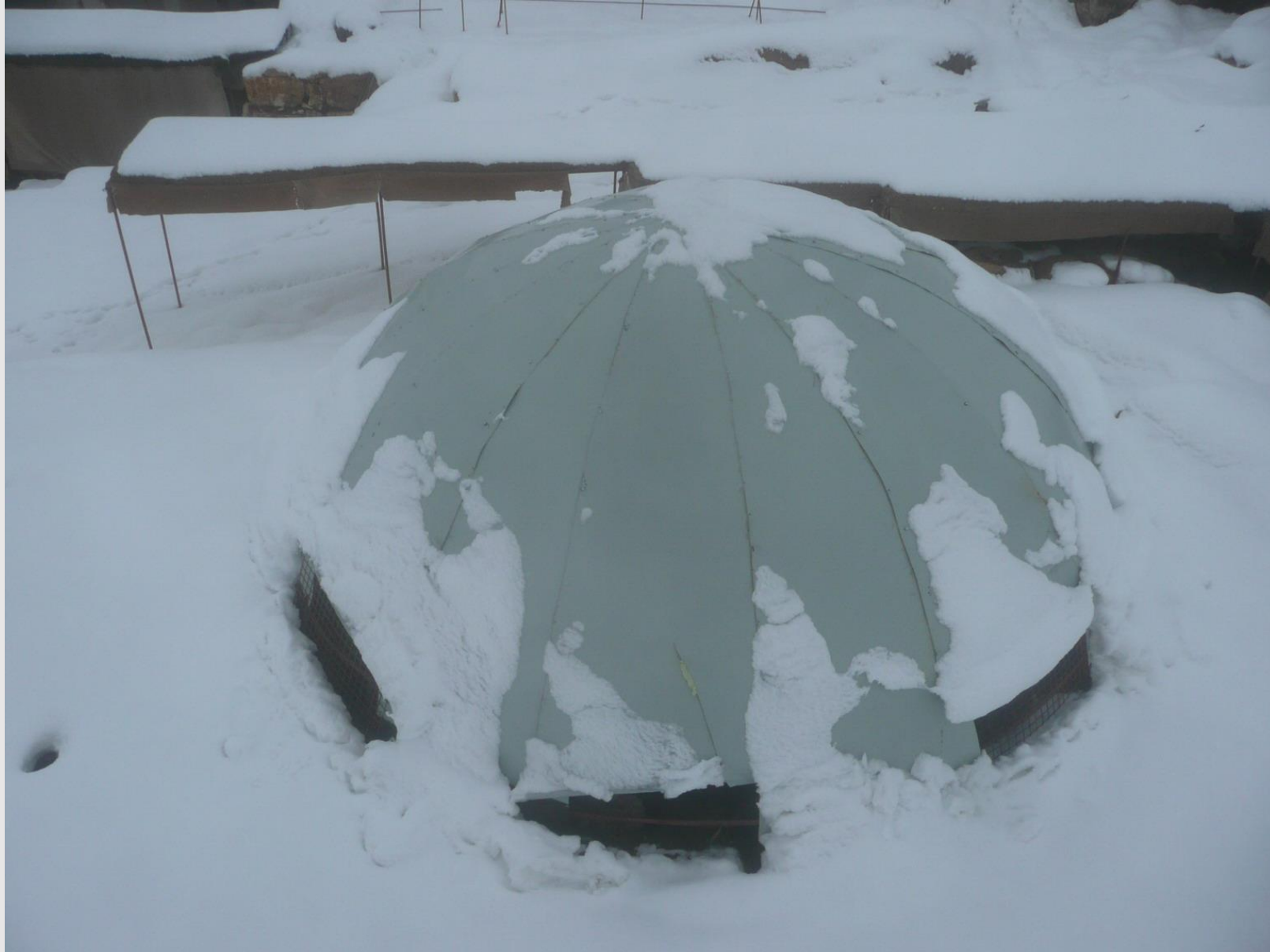
Abi covered with snow